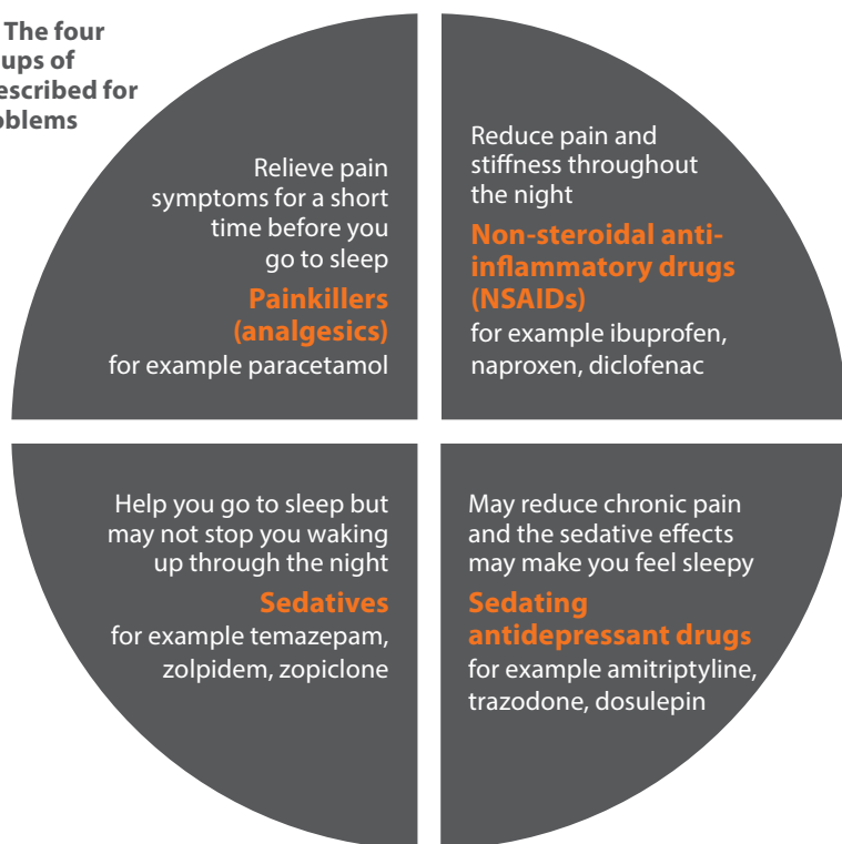
Figure 2 The four main groups of drugs prescribed for sleep problems

Sedating antidepressant drugs – Some antidepressant drugs, such as amitriptyline, dosulepin and trazodone, have sedative effects, which means they make you feel sleepy. They may also reduce chronic pain. These drugs aren't given as sleeping tablets but may improve sleep as an added benefit. It's often advisable to take them a few hours before going to bed so that the effect has worn off by the morning.