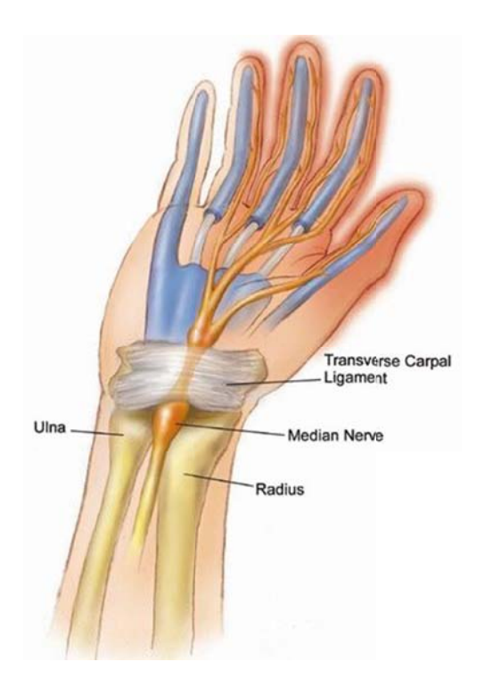
Non-Operative Treatment for Carpal Tunnel Syndrome